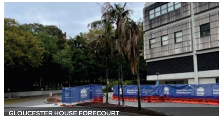
GLOUCESTER HOUSE FORECOURT