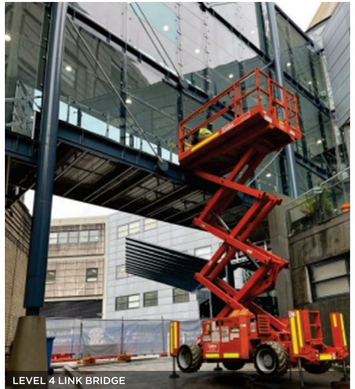
LEVEL 4 LINK BRIDGE