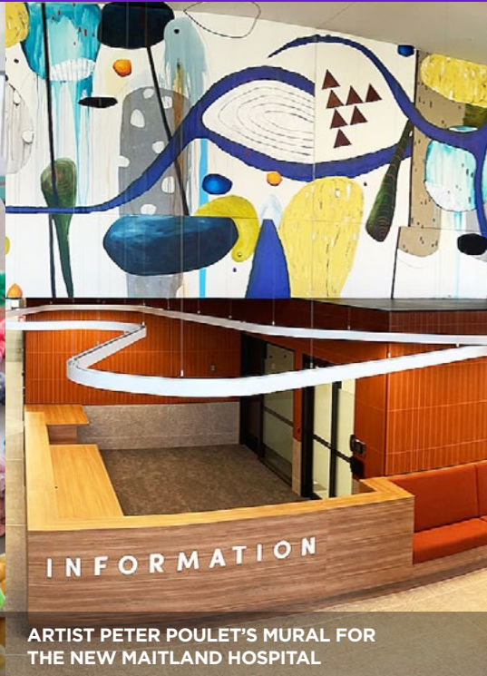
ARTIST PETER POULET'S MURAL FOR THE NEW MAITLAND HOSPITAL