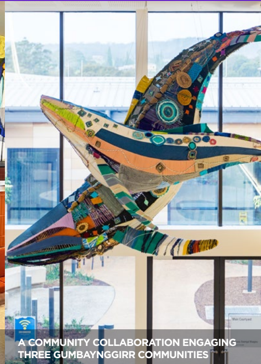
A COMMUNITY COLLABORATION ENGAGING THREE GUMBAYNGGIRR COMMUNITIES