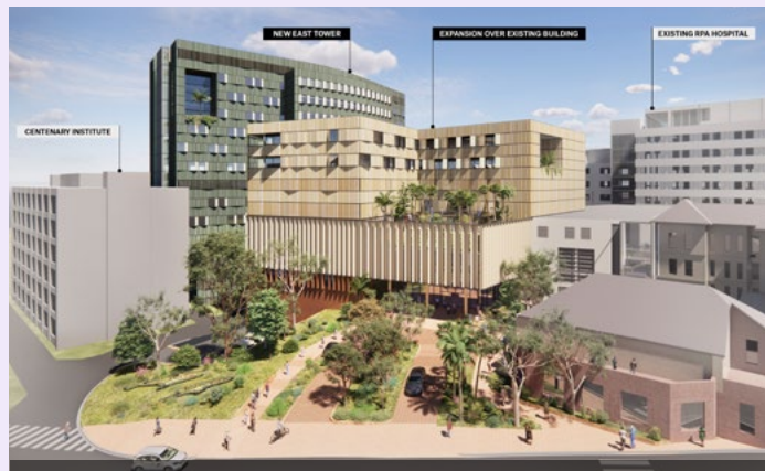
ARTIST IMPRESSION: RPA HOSPITAL NORTHERN ARRIVAL