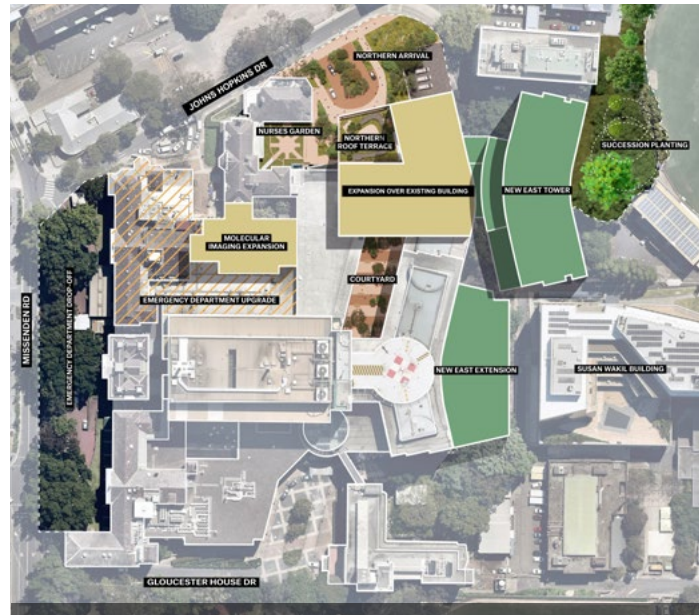
ARTIST IMPRESSION: RPA HOSPITAL REDEVELOPMENT SITE MAP

Indigenous construction company Barpa were the successful candidates in the contract tender for enabling works. A majority Indigenous owned company, Barpa prides themselves on respectful Indigenous engagement and strives to make a positive difference for Australia's First Peoples. Barpa has extensive experience in delivering complex infrastructure within the health sector.