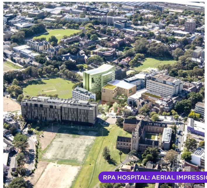
RPA HOSPITAL: AERIAL IMPRESSION

The project team is committed to keeping you updated. We are keen to share project information with your school, community group or other organisation.