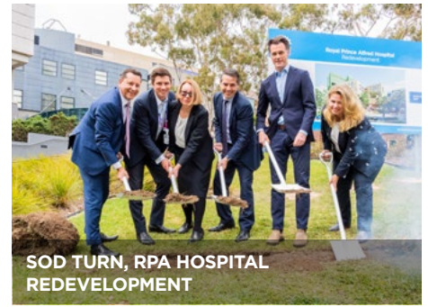
SOD TURN, RPA HOSPITAL REDEVELOPMENT