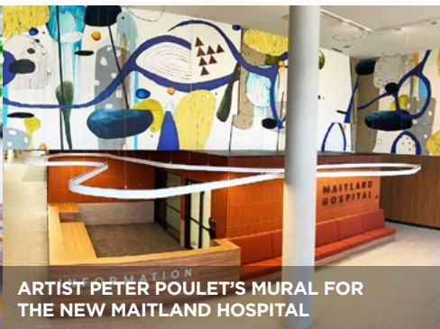
ARTIST PETER POULET'S MURAL FOR THE NEW MAITLAND HOSPITAL