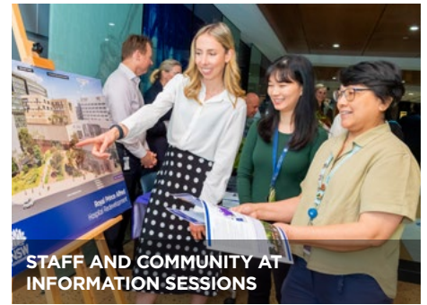
STAFF AND COMMUNITY AT INFORMATION SESSIONS