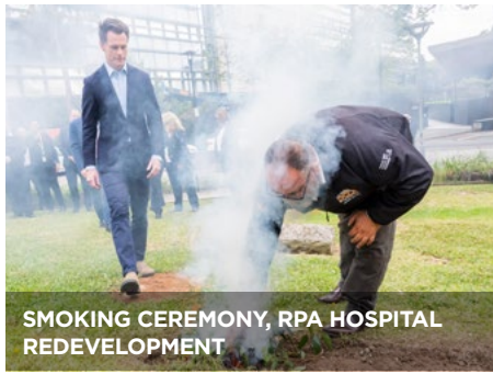
SMOKING CEREMONY, RPA HOSPITAL REDEVELOPMENT

Celebrated on-site with a smoking ceremony and sod turn, the event marked the start of a significant chapter for the project. It was a celebration of our commitment to expanding our capacity to better serve the growing health care needs of our community.