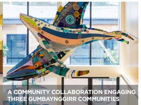
A COMMUNITY COLLABORATION ENGAGING THREE GUMBAYNGGIRR COMMUNITIES