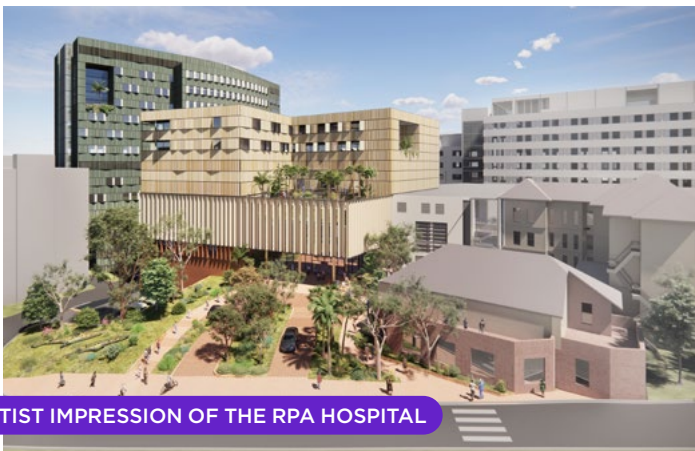
ARTIST IMPRESSION OF THE RPA HOSPITAL

We will continue to work closely with our valued stakeholders to keep you informed every step of the way. Thank you for your patience as we bring this important project to life.