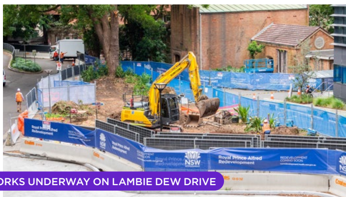
WORKS UNDERWAY ON LAMBIE DEW DRIVE

As construction activities across the campus increase, we will continue to keep you informed through works notices on the project website and updates to our interactive map . Make sure you subscribe to our regular project updates to keep yourself informed on all things RPA.