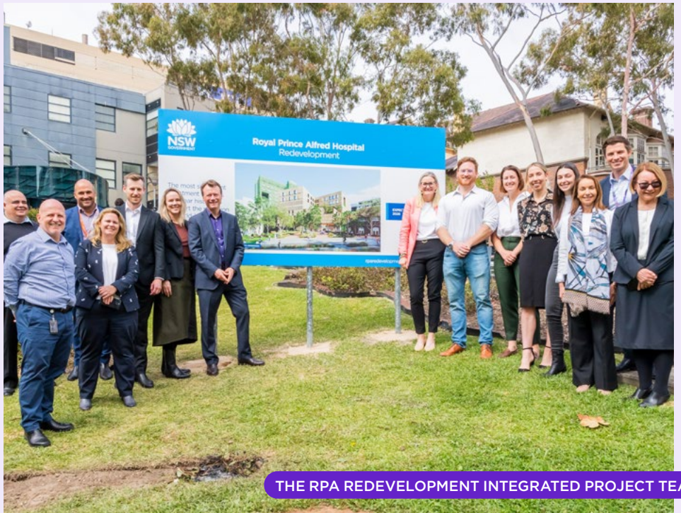
THE RPA REDEVELOPMENT INTEGRATED PROJECT TEAM