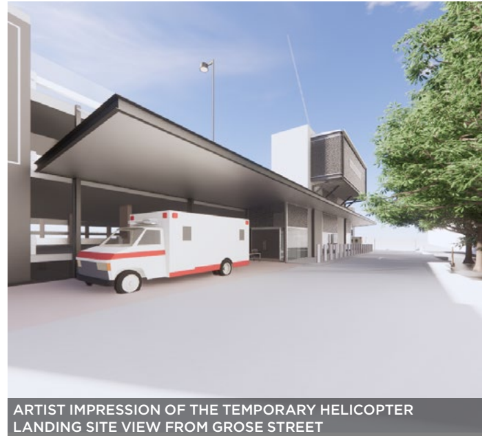
ARTIST IMPRESSION OF THE TEMPORARY HELICOPTER LANDING SITE VIEW FROM GROSE STREET

Please contact us with any questions you have about our work. We will continue to provide you with updates throughout this project.