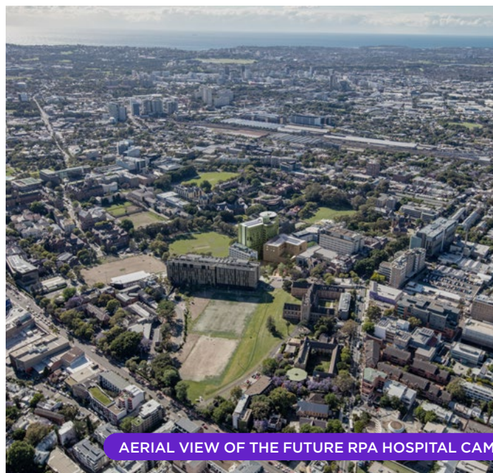
AERIAL VIEW OF THE FUTURE RPA HOSPITAL CAMPUS

The next step in the SSDA process is the assessment period. A report is produced by DPE that recommends Conditions of Consent and following that is approval, or determination of the application. For further detail please see our planning fact sheet .