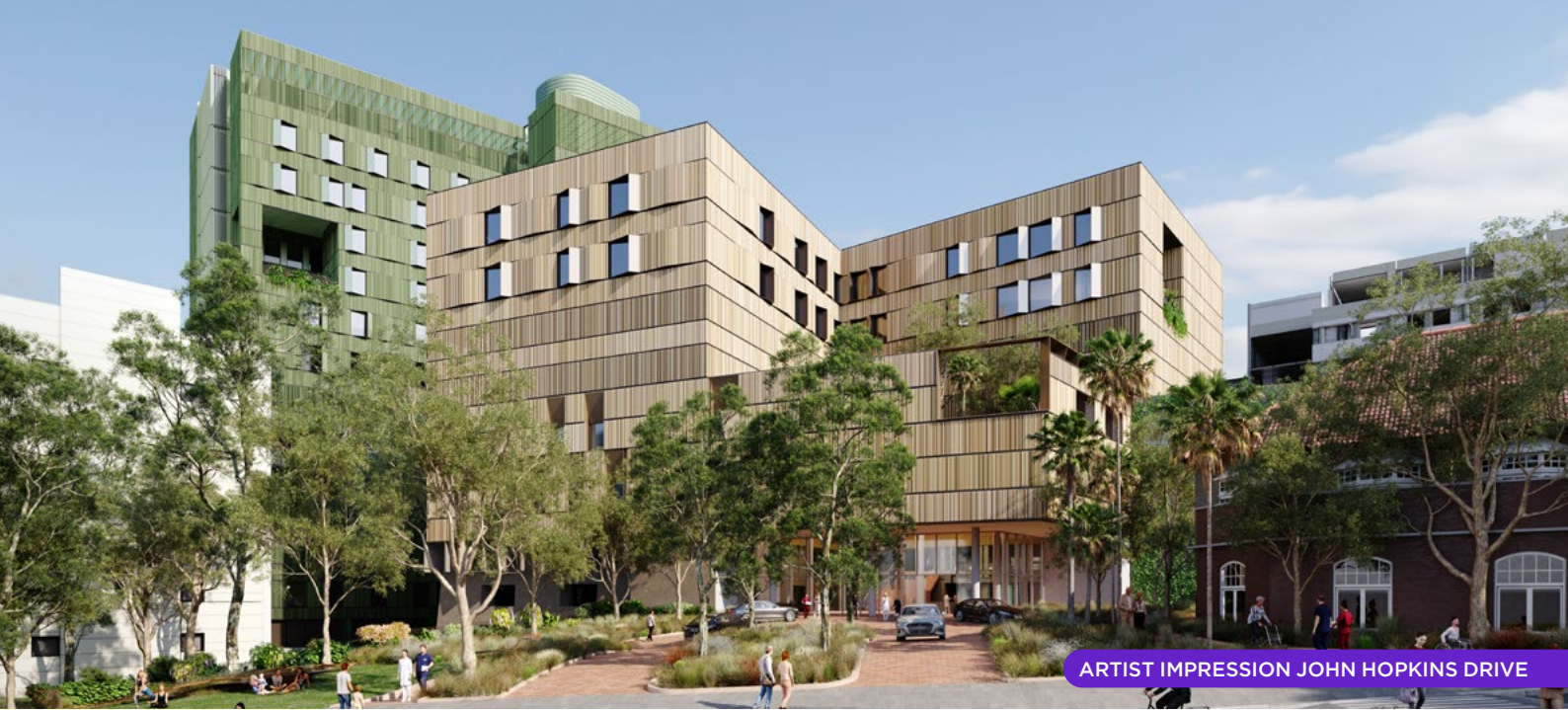
ARTIST IMPRESSION JOHN HOPKINS DRIVE