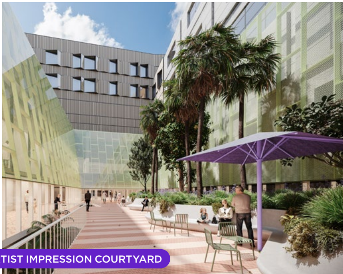
ARTIST IMPRESSION COURTYARD